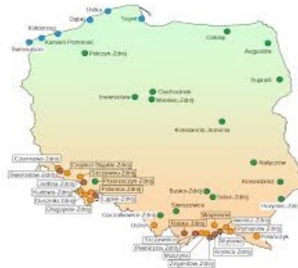
Fig. 1 Spa health care enterprises in Polen

Spa health care enterprises offer approximately 44.000 beds (of which approx. 35.000 are provided in spa sanatoriums and approx. 8.000 in spa hospitals). In addition, spa municipalities (an administrative area which was granted the Health Resort statute) offer a well-developed tourist base (hotels, guest houses, B&B accommodation) providing the total of approx. 80.000 beds as the potential accommodation facilities for the spa health care outpatient treatment.