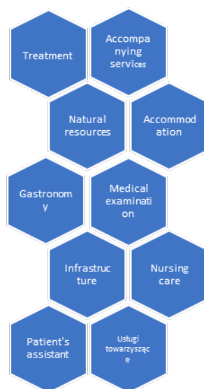
Fig. 4 The framework of individual components included in the offer

Adjusting the offer to the specificity of 55+ clients requires introducing modifications in the selected areas. It is worth noting more frequent stays of people aged over 75, which forces radical changes in customer service. Table 1 presents the areas of required changes, identified during interviews, along with the proposals for implementing specific solutions.