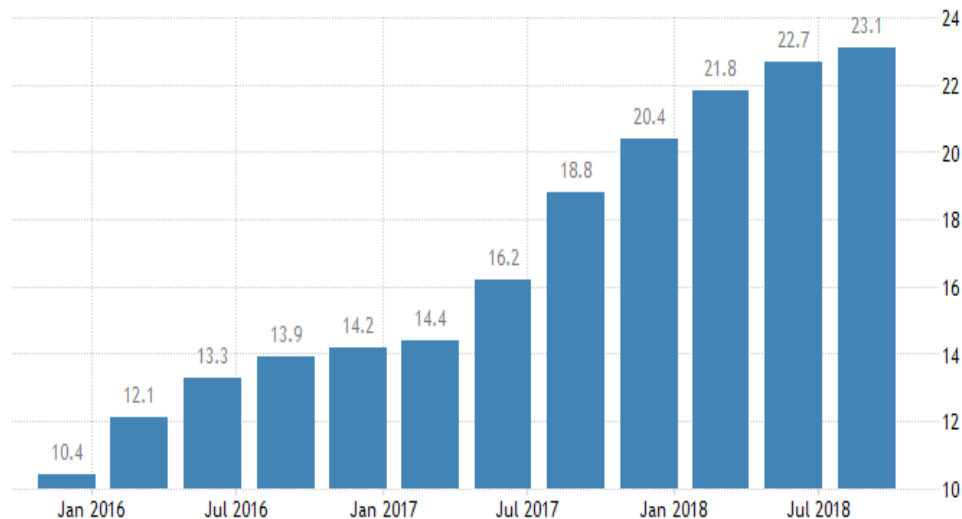
Figure 2. Nigeria's unemployment rate between 2016 and 2018