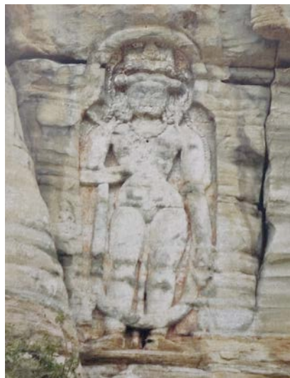
Figure 4. Maitreya, Sod, Near Hambuting La, Kargil