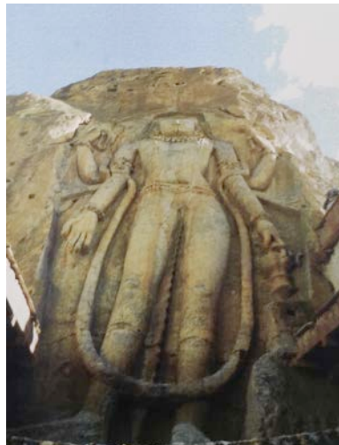
Figure 3. Maitreya, Rock-cut, Mulbek