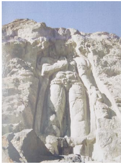
Figure 5. Maitreya, Rock-cut, Karshekar, Suru Valley, Zaskar