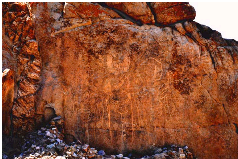
Figure 6. Avalokiteshvara, Upshi, Rock-cut, Leh-Manali Pass

So Ladakh was not an isolated phenomenon. However, close to the monastery of Shergol, on the national Highway, located close vicinity to the Maitreya image of Mulbek, there are no cave settlements or larger Buddhist monasteries to be found near any of these carvings, as it is in case of Bamiyan/Afghanistan, Dunhuang or other cave monasteries along the silk routes, which importance as central cultic Images. However, some of the image have been created at rather significant places. It seems quite likely that some wealthy merchants, who used these routes and had to cross these passes again and again on their journeys from Kashmir to Central Asia and vice-versa, presumably in accordance with some local sovereign, donated these rock images as both a way to earn merit as well as a sign of gratitude for having survived the dangerous voyage. It may be inferred as creating as creating these images was an attempt to ban the horrors of a local natural calamity as one would again and again be travelling on these routes and thus wanted to assure oneself of a safe journey. Nevertheless, the rock images may be taken as signs of the cultural exchange between the initiators (Kashmiri) and the local population.