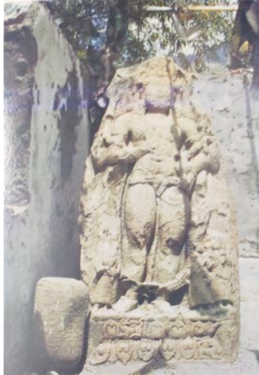
Figure 2. Avalokiteshwara, Drass, Kargil